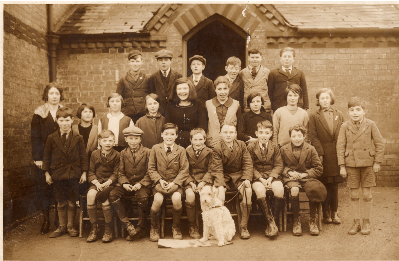
Mrs Addy's Class of 1932

Do check out this new resource for the village. There is a limited number of items already uploaded - we're just waiting for you to add yours!